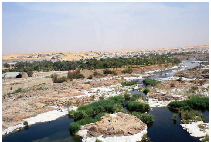
The Nile River, below the Aswan Low Dam. An increase of schistosomiasis cases followed increased damming along the Nile

During the early stages of control in the 1930's, efforts emphasized national health education campaigns to reduce contact with contaminated water [5]. These campaigns were likely an attempt to offset the growing number of infections correlated to increased water contact following the construction and expansion of the Aswan Low Dam. The Aswan Low Dam was opened in 1902, but alterations to increase dam height continued until 1933 when the dam reached its peak height [2]. This was followed by an increase of Schistosoma haematobium infections between 1934 and 1937 in four investigated areas. Studies showed that baseline levels of prevalence varying from 2-11% rose to 44-75% following dam expansion [9]. By the 1930's, over two-thirds of Egyptian agricultural practices utilized perennial irrigation [2]. Despite the fact that concurrent health education campaigns were implemented to promote schistosomiasis awareness, the disease continued to spread [5].