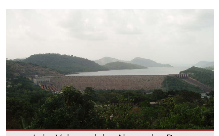
Lake Volta and the Akosombo Dam

Despite the fact that Ghana represents one of the most severely affected countries from chronic schistosomiasis, little effort has been made to address this public health issue through control programs. The latest schistosomiasis intervention strategy was led by World Vision International and carried out between 2009 and 2011. The strategy was based on the World Health Organization's current recommendations emphasizing mass drug administration of praziquantel in school-aged children as part of a package to address endemic parasitic diseases [7]. Small scale studies have suggested that an integrated approach to control that includes health education, sanitation improvement, and reduced human-water contact is necessary for success [8].