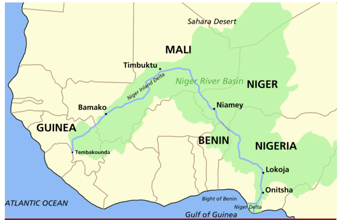
The Niger River Basin [9]

Snail distribution is widespread throughout the country, where the physical landscape provides diverse habitat conducive to supporting established populations of Bulinus globosus , B. truncatus , B. senegalensis , and Biomphalaria pfeifferi . The Niger River and Benue River basins, the Lake Chad depression, and lakes dotting the region lend marshy, riparian environments suitable to snail intermediate hosts [4]. Construction of dams and reservoirs has created additional infection hotspots [4]. Rice and cocoa-producing areas and gold and tin mines that use large quantities of water for processing also represent high risk zones [4].